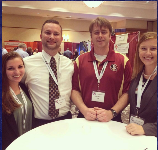
Student interns attending FEPA Annual Meeting and Work Session, February 2018.